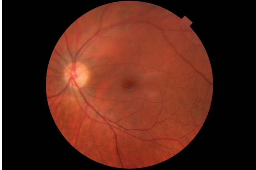
Normal retinal photograph